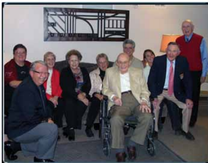
The Dressage Foundation Board