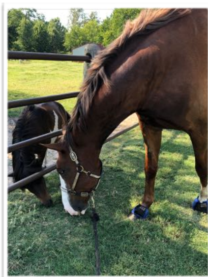
Melissa Furman's 17.1h Pleasant Picasso grazes next to a miniature pony. Friends come in all sizes!

What have you been up to lately? Send fun photos to the newsletter editor! Show us what fun things you have been doing with your horse. Trail rides? Clinics? Shows? Spa day? Let's see what you've been doing with your horses! Send photos to: newsletter@dressageoklahoma.org .